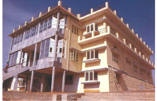
The new Ramamani Iyengar High School

The land around the high school is quite barren and Bellur is surrounded by stone quarries. The building is well designed making a very conducive and pleasant environment for the students. As well as a large quadrangle for meetings and special functions the school has a pleasant yoga room, which is equipped with ropes and many, many photographs of Guruji doing asanas .